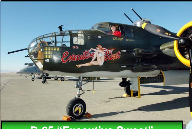
B-25 "Executive Sweet"

The 2011 Minter Field Fly-In promises to bring in the most aircraft ever assembled on the tarmac. We're expecting up to 100 airplanes, including Warbirds, Experimentals, Antiques, General Aviation, Helicopters and Jets.