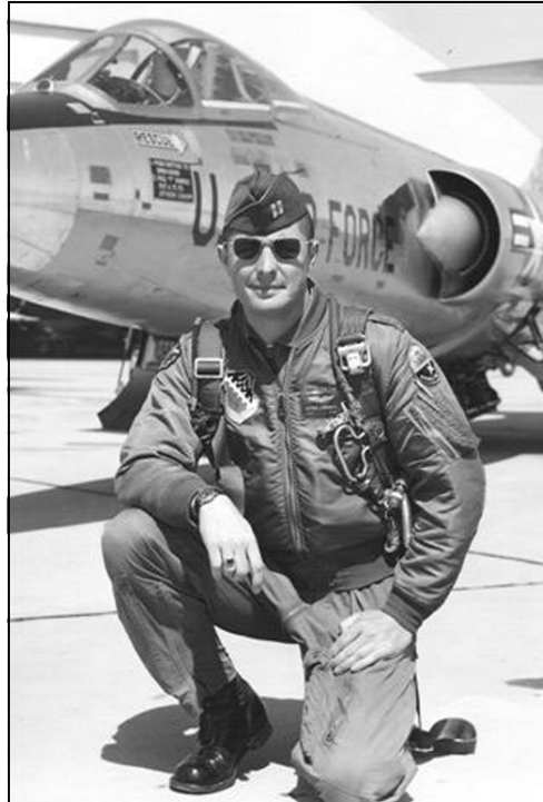
Edwards Test Pilot—1964